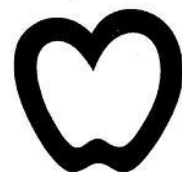
apple or heart